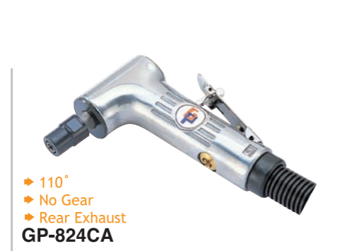
110° No Gear Rear Exhaust GP-824CA