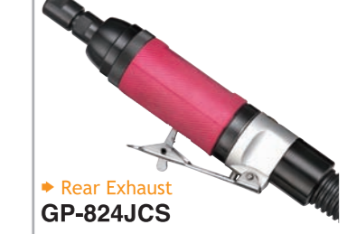
Rear Exhaust GP-824JCS