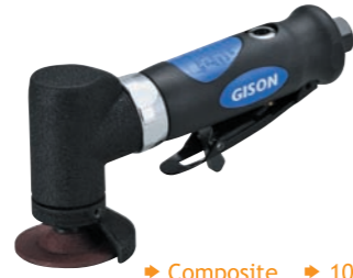
Composite No Gear 100° Rear Exhaust GP-824CGR