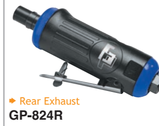
Rear Exhaust GP-824R