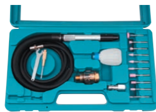
GP-8245CK / GP-8246CK