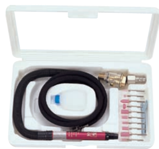
GP-8240K / GP-8243K