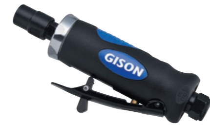
Composite Rear Exhaust GP-824LGR