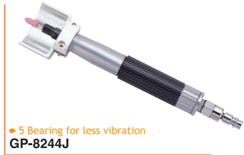
5 Bearing for less vibration GP-8244J