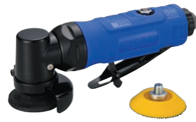
Grinder & Sander GP-824GS