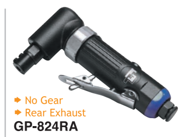
No Gear Rear Exhaust GP-824RA