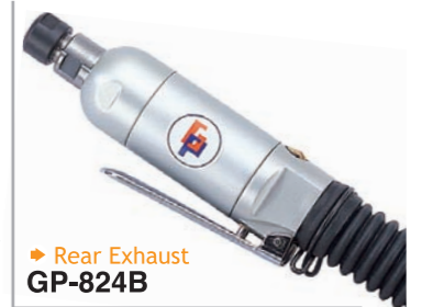
Rear Exhaust GP-824B