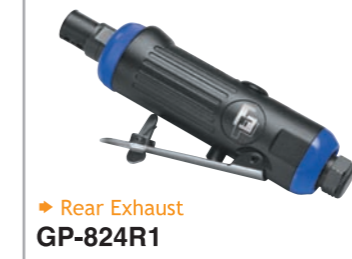
Rear Exhaust GP-824R1