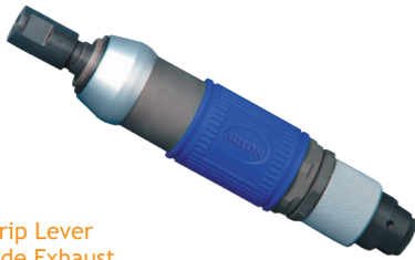
Grip Lever Side Exhaust GP-824JS