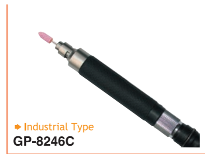
Industrial Type GP-8246C