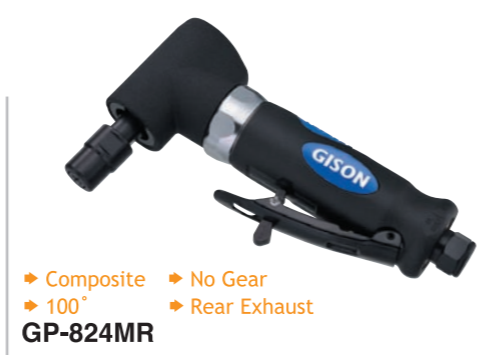
Composite 100° No Gear Rear Exhaust GP-824MR