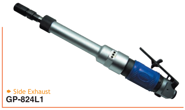
Side Exhaust GP-824L1