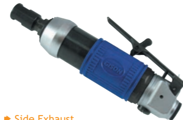
Side Exhaust GP-824JH